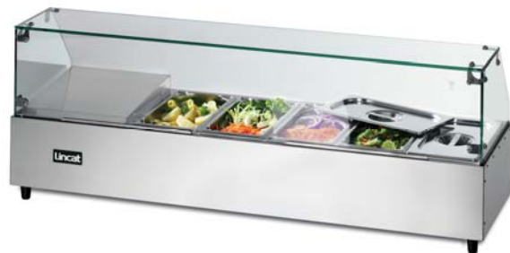
FPB5 with PBG5